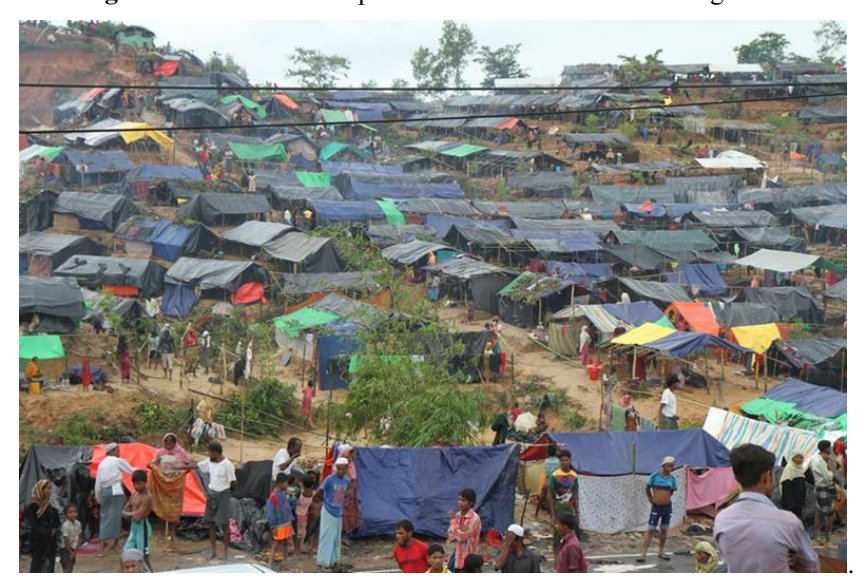
Figure 1: Makeshift camps at Cox's Bazar District in Bangladesh