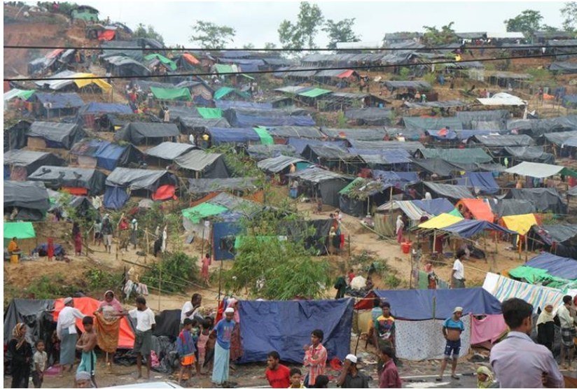
Figure 1: Makeshift camps at Cox's Bazar District in Bangladesh